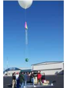
Wright State University