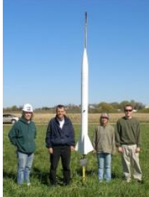
Lorain County CC