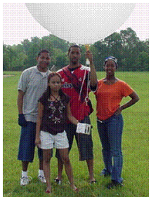
Central State University

Increases student exposure to design requirements of space hardware and provides opportunities for students to experience hands-on STEM activities. Practical team-building skills are developed as students prepare for the future STEM workforce. Funding is provided to student-led Balloon Satellite/Robotics/Rocket/Underwater Robotics/UAS/Design programs to Affiliate universities. To date, Case, Western, Cedarville, Central State, Cleveland State, Kent State, Lorain County Community College, Miami University, Ohio Northern University, Ohio State, Ohio University, Sinclair Community College, The University of Akron, University of Cincinnati, University of Dayton, The University of Toledo, Wright State, and Youngstown State all have active student-led teams.