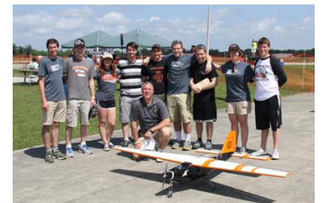
Ohio Northern University “Bad News Bears”